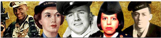
Hand Painted Mural Size 8' x 35'

Team Fondy First commissioned a 10ft x 40ft mural honoring veterans from each branch of service. This mural will raise awareness about this specific population in our community and help to beautify Fond du Lac's downtown area. Overall, the team's goal was to pay tribute to veterans, embrace the arts within the community by hiring a local artist, and spark interest within the community for future endeavors involving veterans.