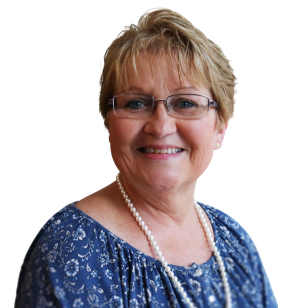
Jackie Robinson Agricultural Ambassador