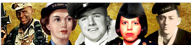
Hand Painted Mural Size 8' x 35'

Team Fondy First commissioned a 10ft x 40ft mural honoring veterans from each branch of service. This mural will raise awareness about this specific population in our community, and help to beautify Fond du Lac's downtown area. Overall, the team's goal was to pay tribute to veterans, embrace the arts within the community by hiring a local artist, and spark interest within the community for future endeavors involving veterans.